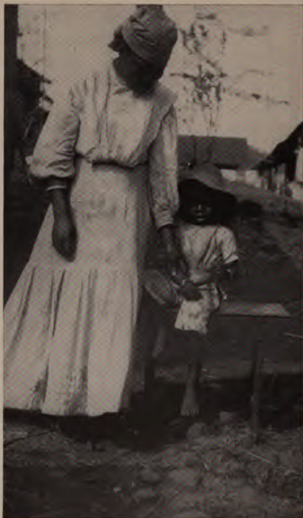
Some of the "Enumerated"